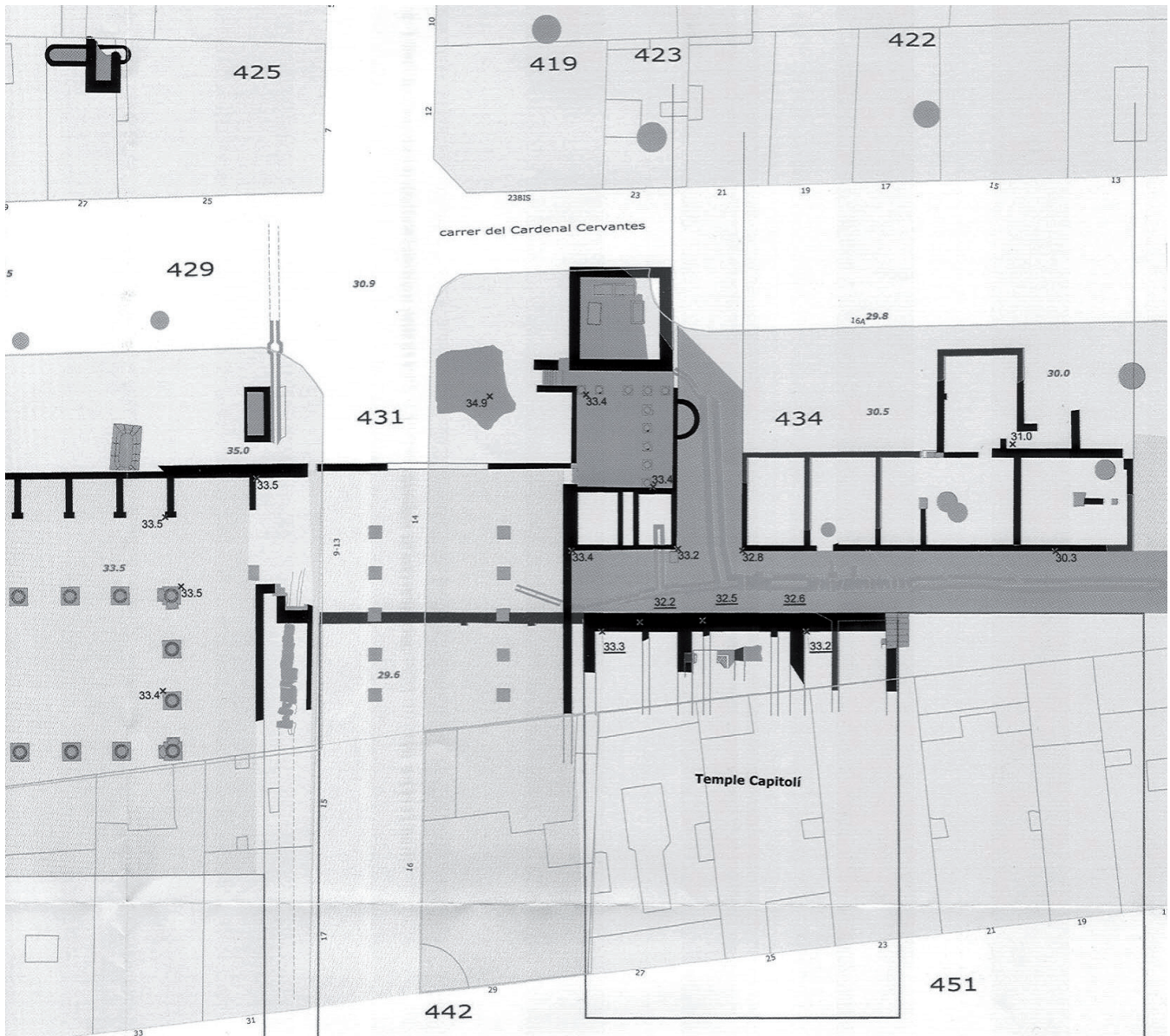
Figure 10. Tarraco (Tarragona): Interpreted layouts of the remains of a possible Capitoline temple and its immediate environs (from Macias et al. , Planimetria... op. cit. plate 10).

only if formulated from a functional standpoint: the territory and the political and military situation in which the programme must have been applied were quite different to the atmosphere in which that ancient model emerged. However, adaptation to the needs and peculiarities of the setting in which they acted must have led to the adoption of some similar solutions. Furthermore, we cannot discard the possibility that the memory of the old model still survived.