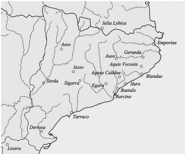
Figure 1. Map of Catalonia with the location of the main cities in the Roman period: Aeso (Isona), Ilerda (Lleida), Dertosa (Tortosa), Iesso (Guissona), Sigarra (Els Prats de Rei), Tarraco (Tarragona), Egara (Terrassa), Barcino (Barcelona), Baetulo (Badalona), Iluro (Mataró), Blandae (Blanes), Emporiae (Empúries), Gerunda (Girona), Auso (Vic), Aquis Voconis (Caldes de Malavella), Aquae Calidae (Caldes de Montbui) and Iulia Lybica (Llívia).

the documentation available. “Studies on cities, based primarily on archaeological documents,” he used to say, “are the outcome of many years and teams. Supporting or refuting aspects we have mentioned now entails years and years of work.” 2