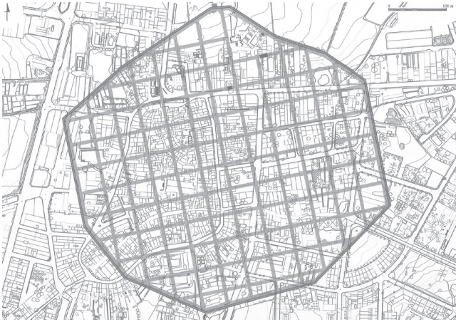
Figure 6. Iesso (Guissona): Interpretative scheme of the wall and the urban layout of the city drawn up from the information available on its archaeological topography, and superimposed on the layout of the town of Guissona today.

hypothesis about the general features of its urban layout. The northern boundary of the urban perimeter has been established with confidence thanks to the fact that part of the wall was uncovered through the excavation. For the western and southern boundaries, an analysis of aerial photographs and plot maps combined with the information provided by the archaeological remains documented have enabled us to sketch a proposed layout, as it seems