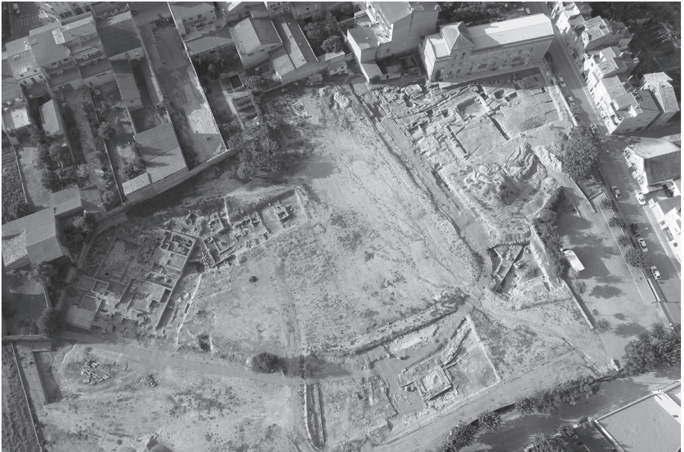
Figure 7. Overall view of the Archaeology Park of Guissona in the process of excavation, with the remains of the north wall, the public baths and numerous houses and streets from the Roman city of Iesso (Guissona).

By combining this information with the possible perimeter, a hypothetical general schema was proposed that