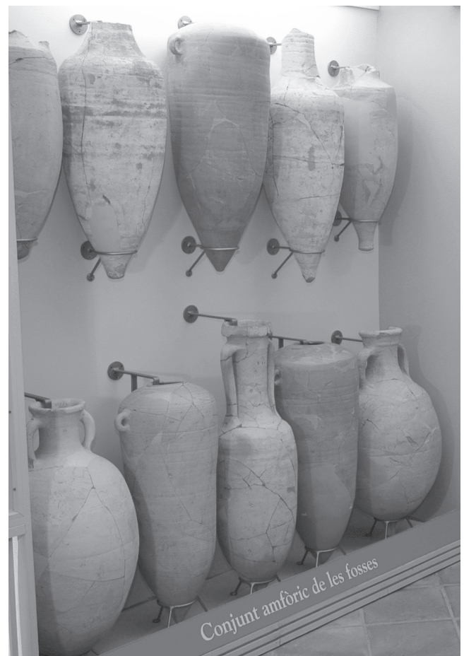
Figure 8. Sample of amphorae found inside the graves that can be dated from the start of the city of Iesso (Guissona).

With regard to the proto-historic settlement in Guissona, archaeology has documented it only partly, but enough to state that it developed over several centuries yet was abandoned at the height of the Iberian period in around the 4th and 3rd centuries BC. There must have been a population contraction in the early 4th century BC, just like in other points around the country, when people tended to enclose themselves on high ground, which was easier to defend. The Puig Castellar Iberian settlement in Talteüll, located six kilometres northeast of Guissona on a hill next to the Llobregós River within the township of Biosca, was quite probably the point where the inhabitants of this zone concentrated at the peak of the Iberian period. On the land of what is today Guissona, the fountain might still have been frequented between the 4th and 2nd centuries BC, and there might have been some shack or small, modest home, but not an Iberian settlement per se. The city of Iesso was founded in the