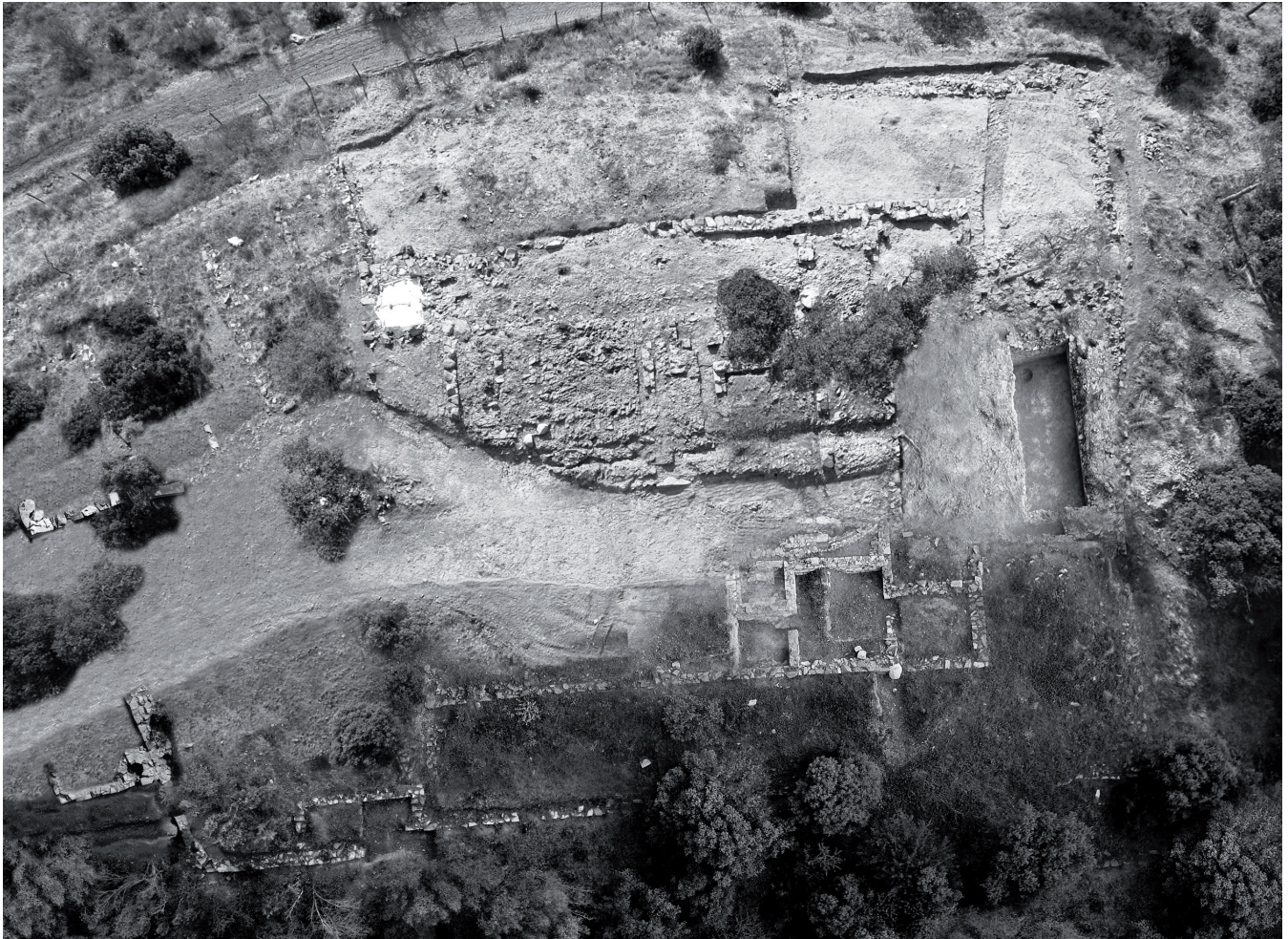
Figure 5. View of the Can Tacó site (Montornès del Vallès) dating from the 2nd century BC, currently in the process of excavation.

roads. The main part of the building was a quadrangular body measuring 750 square metres, and the entire complex was surrounded by a perimeter wall with an entrance gateway flanked by a tower. Inside, in addition to this main body, there was also an open area, several service areas that might have housed a small garrison, and a large cistern built with the most advanced Roman technology of the day (Fig. 5).