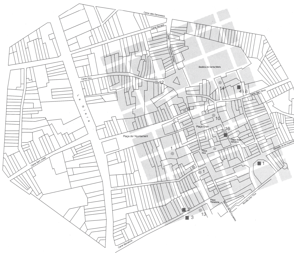
Figure 2. Urban planning layout of the Roman town of Iluro (Mataró). Inside the black box are the sites that we have been able to date from the early years of the 1st century BC (from Garcia et al. , op. cit., note 14, p. 42).

With regard to the layout of urban space, the environs of what is today the basilica of Santa Maria have been pinpointed as the possible site of the city forum, and on the southeast corner of this area remains of baths have been found dating from the imperial period, which were most likely built in the area set aside for this purpose back in the initial plans. 13