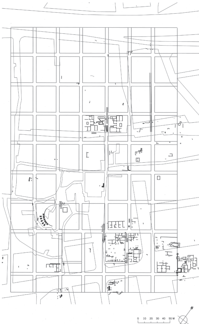
Figure 4. General layout of the archaeological remains documented in the Roman city of Baetulo (Badalona), with the interpretative hypothesis of its urban layout.

The city, located very close to the sea, rose up on the side on a slight elevation with a gentle slope facing southeast but an abrupt drop-off at the start of the beach. This topography determined the structure of the oppidum , which was naturally divided into a lower part with no possibility of directly connecting with the beach, and an upper part built on this slope. The forum, located in the centre, must have been in the upper part near this drop-off, probably seeking a dramatic effect and taking on the role of articulating the different zones in the city. The upper part appears to be a residential area where most of the houses documented to date are located. In contrast, the lower part seems to have been set aside for more communal purposes: bath buildings located on the far southeast of the premises, just like in Iluro, several tabernae (shops) and the remains of other buildings which should probably be interpreted as markets or warehouses have all been documented. The coastal