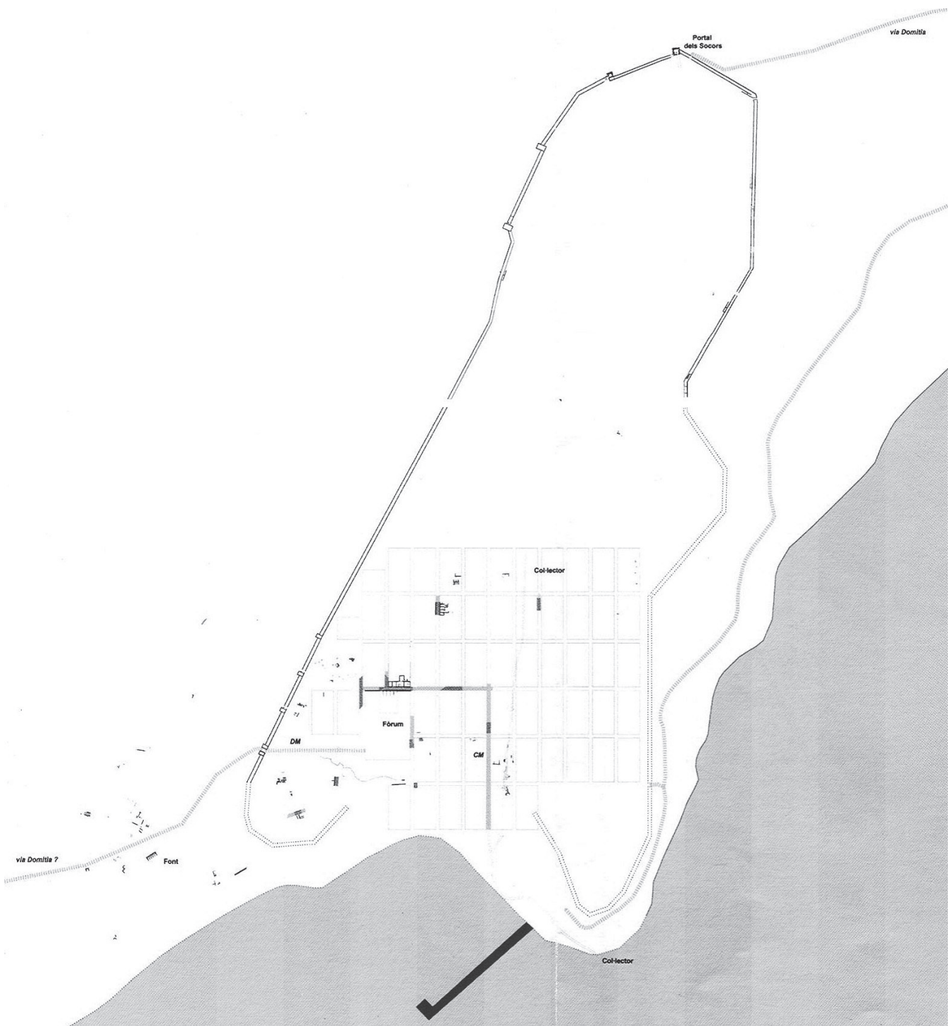
Figure 11. Tarraco (Tarragona): Layout with remains from the Late Republican period with an interpretation of the urban layout of the southern part of the walled premises (from Macias et al. , Planimetria... op. cit. p. 27).

this scheme was only conducted on the southern part of the walled premises, south of today's Rambla Nova, is quite provocative. In the area located between Rambla Nova and the upper part, a regular urban planning model would not have been applied until a later date, perhaps in the second half of the 1st century BC. However, this does not mean that before then it was a construction-free zone, as archaeology has documented Late Republican structures that seem to predate the urban remodelling of this